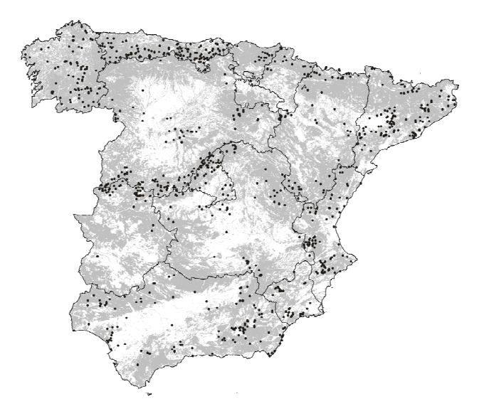
Fig. 1. Location of the 942 profiles established in non-crop areas (grey colour) of peninsular Spain used in the present study.

Every profile also contained information about land use, parental material, soil texture and consistency, elevation and slope, as described in the original publication and geographical coordinates with a resolution of 1°. Of all the profiles in the initial data set, 37 % were excluded due to missing data on one or more of the explanatory variables used to model SOC. The spatial resolution implied that sometimes we had more than one soil profile per coordinate. In these cases we selected the profile for which the vegetation cover reported